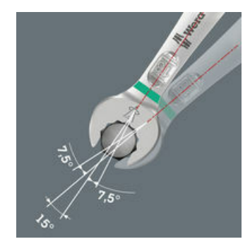
Thanks to the mouth side pivoted by 7.5°, double hexagon geometry and an adjusted application method (placement – screwdriving – turning – replacement – screwdriving – turning, etc), even screwdriving challenges allowing a pivoting angle of less than 30° can be solved.