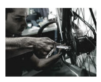
Joker 6003 size 9 for use in switchgears (bicycle gearshift)