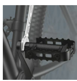
The extra thin pedal wrench (6003 Joker 15 Pedal) is ideal for narrow installation spaces