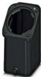
HEAVYCON EVO sleeve housing, plastic, with bayonet flange for EVO screw connection, B6, for single locking latch, height: 87.5 mm, without EVO screw connection

Please be informed that the data shown in this PDF Document is generated from our Online Catalog. Please find the complete data in the user's documentation. Our General Terms of Use for Downloads are valid ( http://phoenixcontact.com/download )