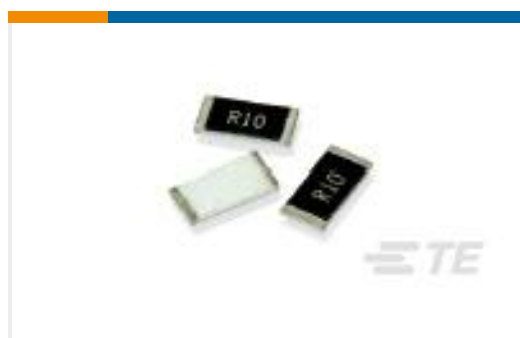
TE Part #2-2176055-5 RLP73K 2B R10 1% 1K RL