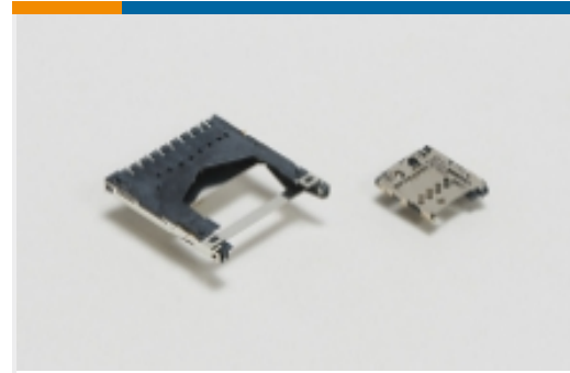
SD Card Connectors(1)