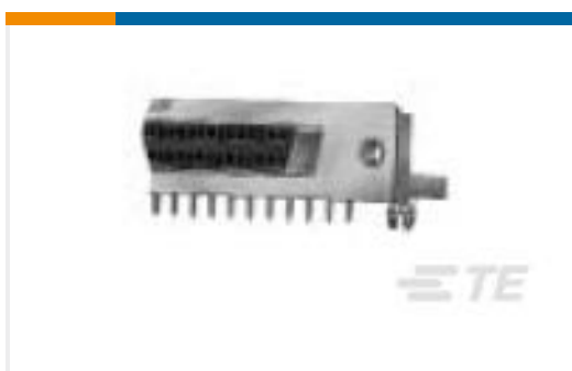
TE Part #5787170-4 40 50SR R/A RCPT ASSY,RDSN L/F