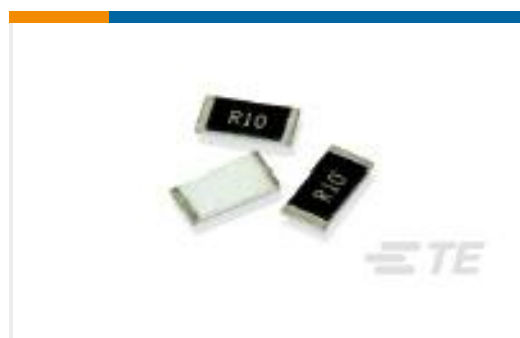
TE Part #2176054-4 RLP73M 2A R068 5% 5K RL