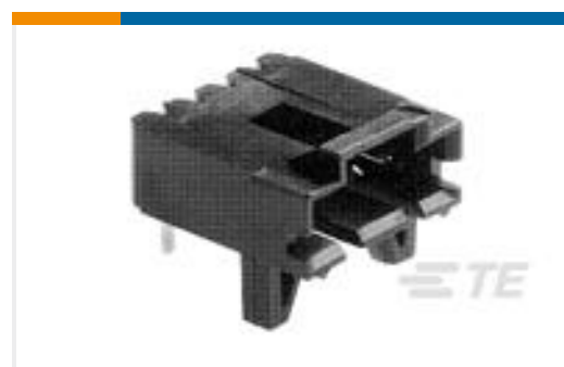
TE Part #103673-4 05 MTE HDR SRRA LATCH W/HLDWN