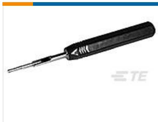
TE Part #1102855-6 EWZG-RSZ