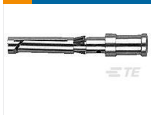
TE Part #2-1105051-2 HN.D-C-BU.AU.0,5