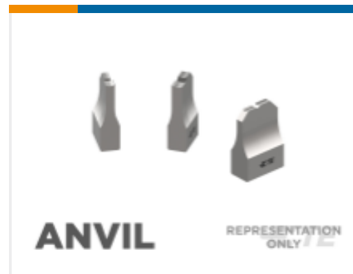
TE Part #1-1633919-6 ANVIL COMBINATION