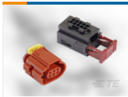
TE Part #1-965641-3 TIMER, CONNECTOR HOUSING