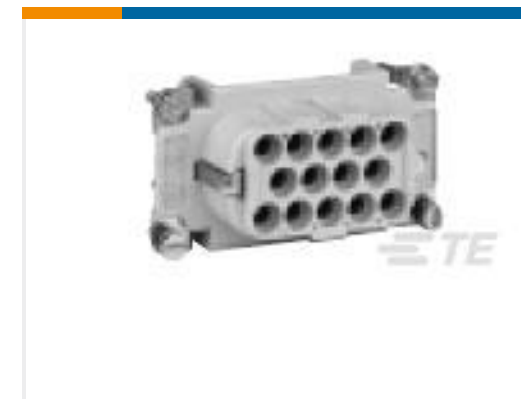
TE Part #2-1104006-3 HVT.14.BU.C