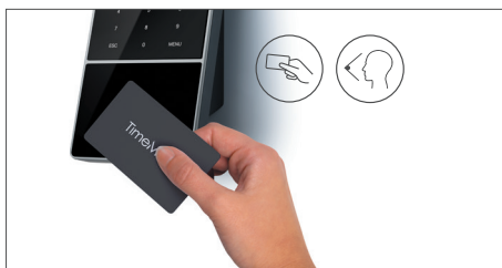
Clocking with RFID proximity card, Face recognition or PIN code