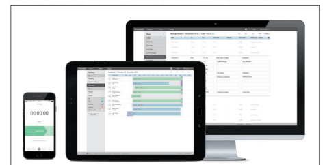
Or TimeMoto Cloud (30 days included)