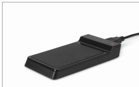
TimeMoto RF-150 USB RFID Reader Art. no: 125-0605