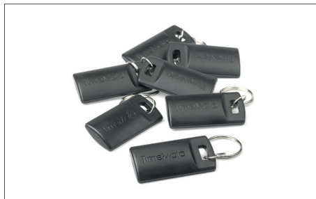
TimeMoto RF-110 set of 25 RFID key fobs Art.no: 125-0604