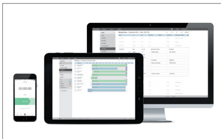
TimeMoto Cloud / TimeMoto Cloud Plus Art.no: 139-0590 / 139-0591