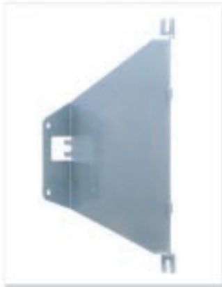
Panel Mounting Bracket