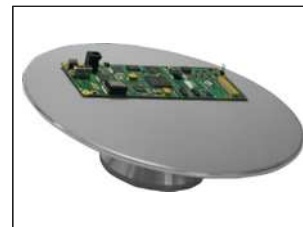
TEK-TILT-PLUS 360° Inspection table and 4D lens Inspection from any angle ESD SAFE

For detailed information, read the complete user manual