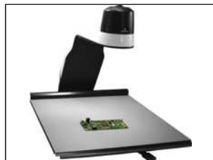
TEK-XY Inspection table Precision x-y gliding stage ESD SAFE

TEK-SCOPE PLUS accessories offer added convenience. For more information visit ideal-tek.com