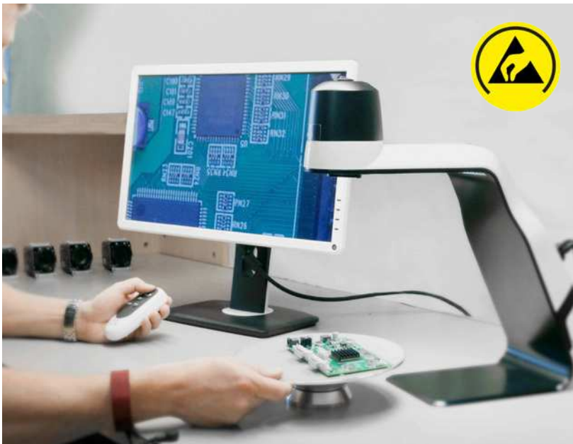
* Monitor not included

Ethernet connection enables simultaneous screen sharing using IP address.