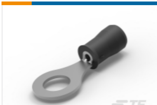
TE Part #1-320551-3 PIDG RING TONGUE TERMINALS