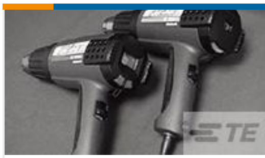
TE Part # CJ2087-000 HL2010E-KIT-120V