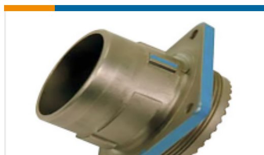
TE Part #YDIV46E21-35SBC009 PLUG ASSY