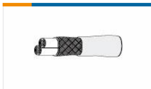
TE Part #066671-000 55A1832-14-MST3-9CS2275