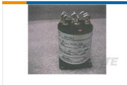
TE Part #1616037-1 DH14B3=RELAY