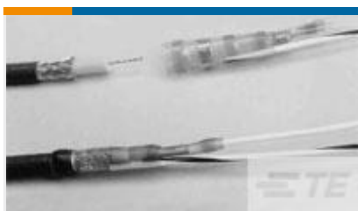
TE Part #109858-000 D-181-1222-90/9