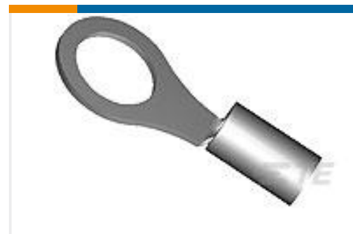
TE Part #36499 TERMINAL, SOLIS R 8 3/8