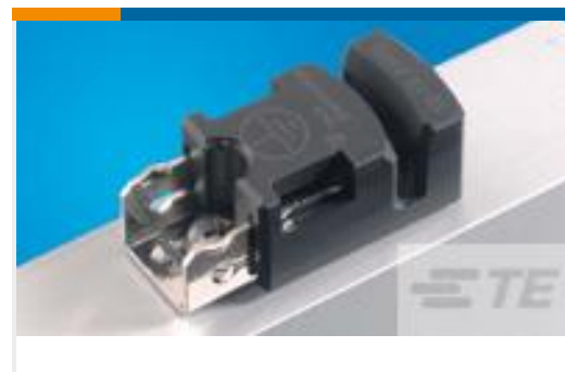
TE Part #1954381-1 Asy, Grounding Clip, 10-12 AWG S