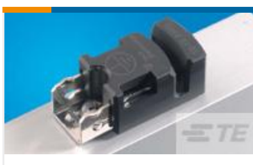
TE Part #1954381-2 Asy, Grounding Clip, 10-12 AWG w