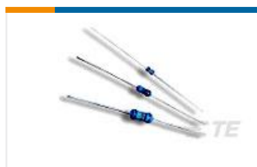
TE Part #1622293-1 LR0204 1% 91R