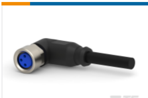
TE Part #2273012-4 M8 R/A LED PIGTAIL