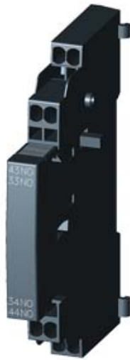
LATERAL AUXILIARY SWITCH 2S, SPRING-L. CONNECTION, FOR CIRCUIT-BREAKERS 3RV2