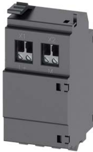
24 VOLT MODULE ACCESSORY FOR: 3VA2 100/160/250