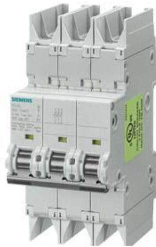
CIRCUIT BREAKER 10KA, 3POLE, D, 5A ACC. TO UL 489 - 480Y/277V