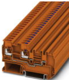
Sensor/actuator terminal block, Connection method: Push-in connection, Cross section: 0.2 mm 2 - 4 mm 2 , AWG: 24 - 12, Width: 7 mm, Color: orange, Mounting type: NS 35/7,5, NS 35/15

Please be informed that the data shown in this PDF Document is generated from our Online Catalog. Please find the complete data in the user's documentation. Our General Terms of Use for Downloads are valid ( http://phoenixcontact.com/download )