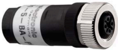
Part no.: 50110650 KD 01-5-BA-PWR Adapter