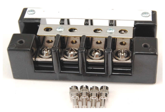
4 pole shown