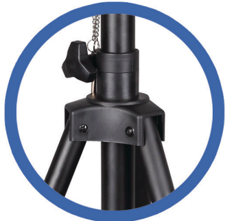
FOLD-OUT TRIPOD BASE FOR QUICK & EASY SETUP