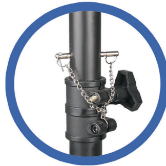
NON-SHIFT LOCKING PIN FOR SECURE POSITIONING & ADJUSTMENT