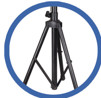
RUBBER-CAPPED LEGS FOR BALANCED & SUPPORT