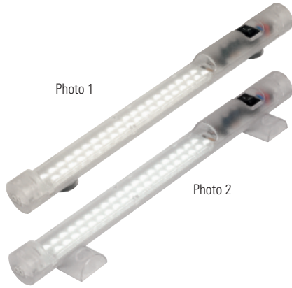
Photo 1: Lamp LED 025 with magnet fixing Photo 2: Lamp LED 025 with screw fixing