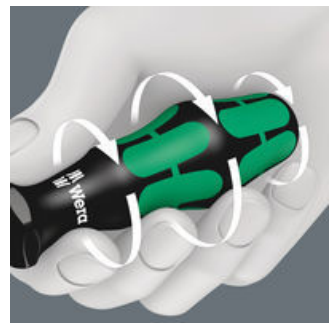
The hard materials used for the handle ensure rapid hand repositioning without any danger of the skin "sticking" to the handle. The surrounding hard zones with large diameters glide like wheels across the hand.

The basic idea for the prototype of the Kraftform handle - that the hand should dictate the design has, right through to today, proved to be correct. In cooperation with the internationally recognised Fraunhofer IAO Institute, Wera developed a screwdriver handle designed to match the shape of the human hand as long ago as the 1960s. After a long development phase, the Wera Kraftform handle was launched to the market in 1968. It has been optimised through the years with new technologies, but has kept its proven shape. After all, the human hand has not changed either.