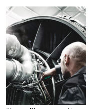
Kraftform Plus screwdrivers – ergonomics you can grasp. They relieve the entire hand-arm system even when used intensively. Along with other technical and product advantages such as the Lasertip for a secure fit in the screw head, Kraftform screwdrivers are the ideal choice whenever manual screwdriving jobs are concerned.