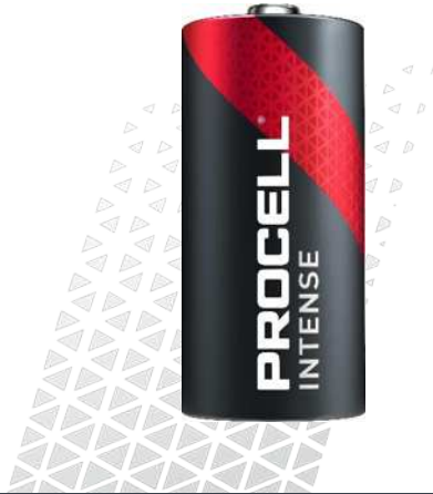
Size: C (LR14) PX1400