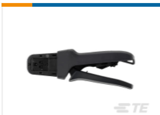
TE Part #DTT-20-03 CRIMP TOOL