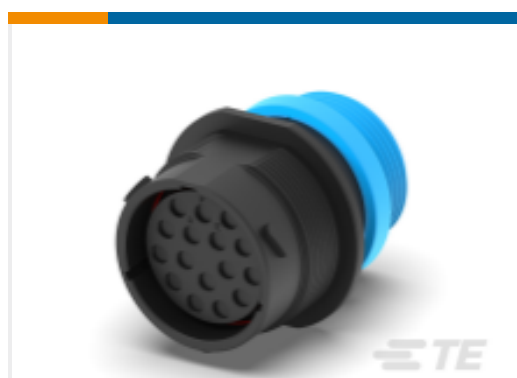
TE Part #HDP24-24-16SE-L015 REC, 16P, BLK, E, THD, 12, S