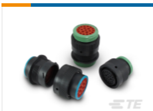
TE Part #YHDP26-24-35PEL017 DEUTSCH HDP20 HOUSINGS