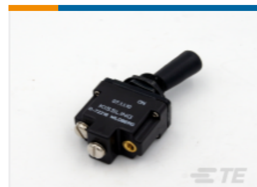
TE Part #K1007153 Toggle Switch 1-Pole, Sealed, Lever, Toggle, Plastic Lever