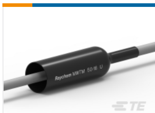
TE Part #834936-000 Medium-Wall Heat Shrink Tubing