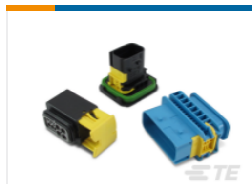
TE Part #2-1564532-1 HEAVY DUTY SEALED CONNECTOR HOUSINGS