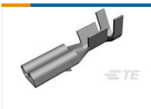
TE Part #160668-6 TERMINAL