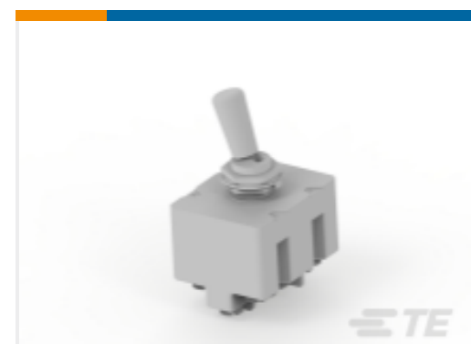
TE Part #K1002956 Toggle Switch 08-4-1-13