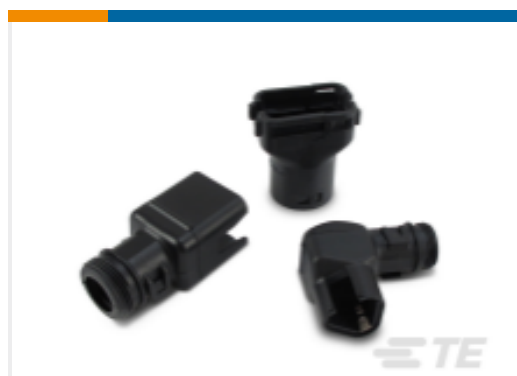
TE Part #1011-232-0305 DEUTSCH DT BACKSHELLS