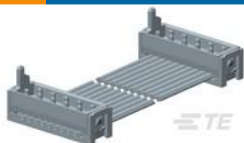
TE Part #1483353-1 MICRO-MATCH LEAD 10P 100MM