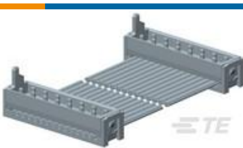
TE Part #1483355-3 MICRO-MATCH LEAD 14P 250MM