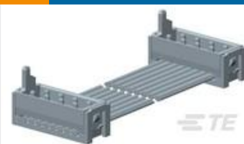
TE Part #1483352-2 MICRO-MATCH LEAD 08P 150MM