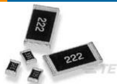
TE Part #1622869-1 CRG0603 1% 1K2