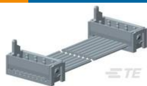
TE Part #1483352-3 MICRO-MATCH LEAD 08P 250MM