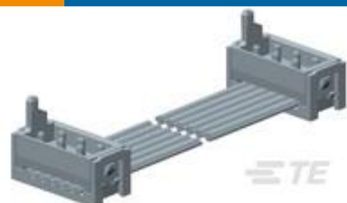
TE Part #1483351-2 MICRO-MATCH LEAD 06P 150MM