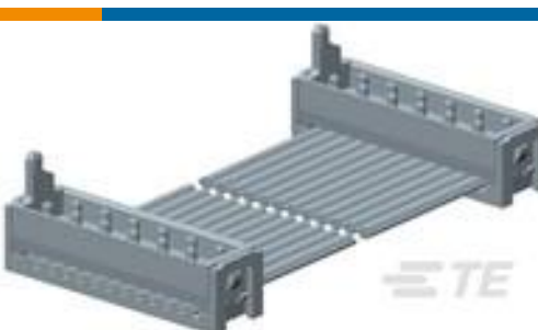
TE Part #1483354-2 MICRO-MATCH LEAD 12P 150MM