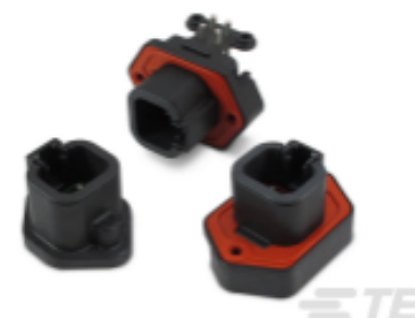
TE Part #DTP13-4P DEUTSCH DTP HEADERS