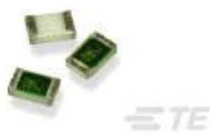
TE Part #1614884-9 CPF 0805 4R7 0.1% 25PPM 1K RL