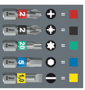
"Take it easy" tool finder with colour coding according to profiles and size stamp - for simple and rapid accessing of the required tool.