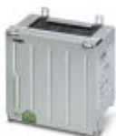
Energy storage device, lead AGM, VRLA technology, 24 V DC, 12 Ah, tool-free battery replacement, automatic detection, and communication with QUINT UPS-IQ

Energy storage - UPS-BAT/VRLA/24DC/12AH - 2320322