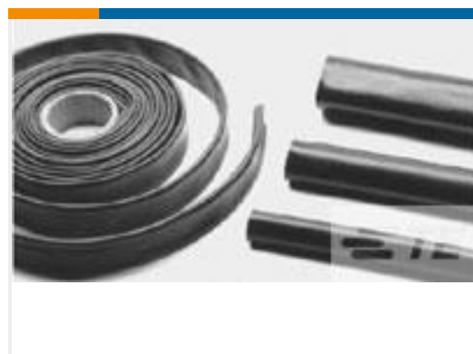
TE Part #CX1369-000 BSTS-13X4FR/NM