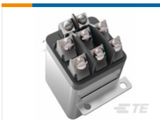
TE Part #1617807-5 FC-335-SY8= RELAY, 3PST