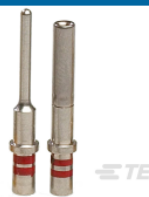
TE Part #ZPF000000000001261 097-0267-16 A1267