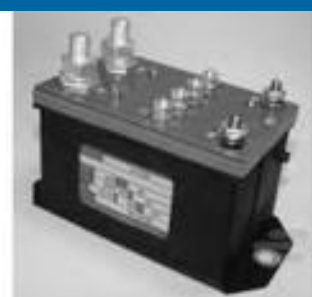
TE Part #1616058-6 A703CD (FAA/PMA)=RELAY