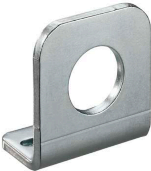
Part no.: 50117257 BT D21M Mounting bracket