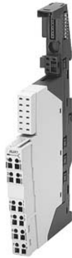
TERMINAL MODULE FOR ET 200S PMD FOR POWER MODULE F. STARTER