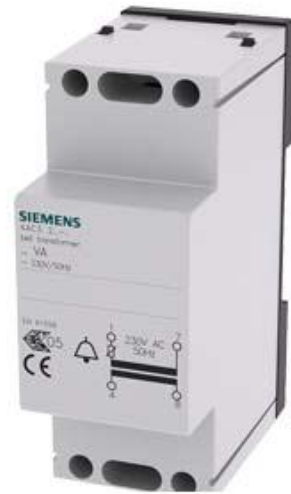
BELL TRANSFORMER, 8VA PRIM 230-240V AC,50HZ, SEK 8V,12V AC WITH PTC PROT.,2MW