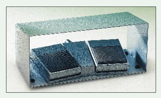
6289-SB (Guard optional)