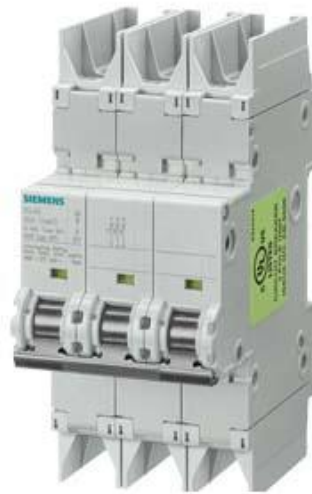
CIRCUIT BREAKER 10KA, 3POLE, D, 4A ACC. TO UL 489 - 480Y/277V