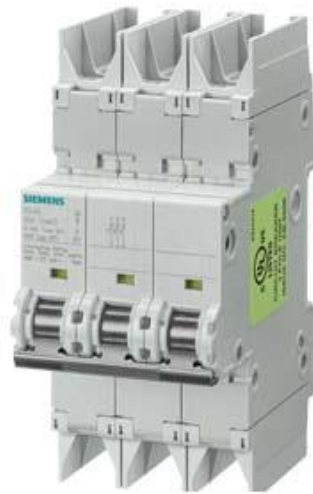
CIRCUIT BREAKER 10KA, 3POLE, D, 20A ACC. TO UL 489 - 480Y/277V