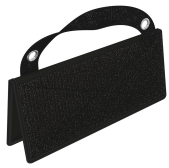
Wera 2go 5 05004354001 1 x 270x135.0x300.0