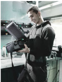
Wera 2go 1 – The outside packer