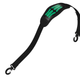
Wera 2go 6 05004355001 1 x 38.0x1470.0