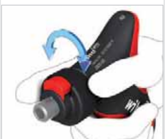
Finely toothed, switchable ratchet