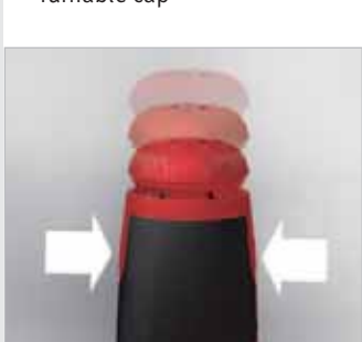
Bit magazine opens at the press of a button.