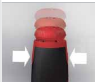
Bit magazine opens at the press of a button.