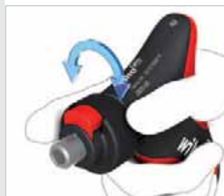
Finely toothed, switchable ratchet

The LiftUp 25 magazine bit holder saves space by storing 25mm bits in its handle. At the press of a button, the bit magazine at the handle end comes out and makes the bits available for removal.