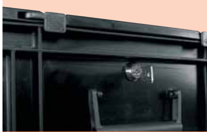
Case with reinforced lid and lock to protect your valuable products from unauthorised access. Various sizes to order.

Useful accessories, practical additions for customising your BLACKLINE® carrying case.