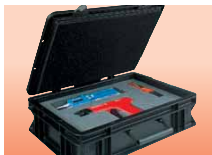
Customised interior e.g. with pre-perforated foam interior blocks to suit your product. (See page 11 for details.)