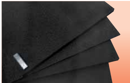
Foam inserts in various sizes and materials. Standard sizes to fit 600x400 and 400x300 mm containers. Standard material is PUR conductive foam, 6 and 15 mm thick. Other sizes and materials on request.