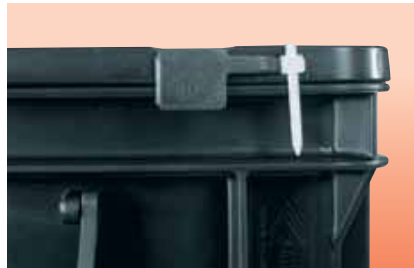
Lid seal to prevent unauthorised opening of swing latches. Ensures 100% product protection.