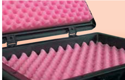
Profiled foam insert for wez lid sizes 600x400 and 400x300 mm. Standard quality available from stock: pink ESD. Ask about other materials and sizes.