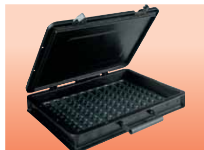
Customised e.g. with product-specific vacuum-formed insert, as sales or presentation package. Ask for details.