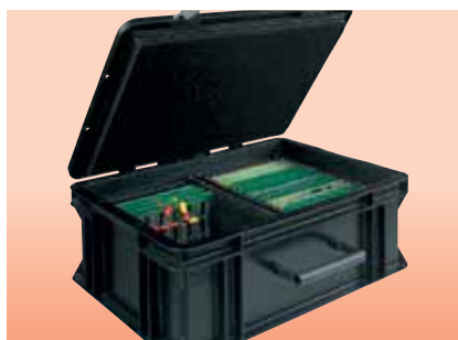
Customised interior e.g. with Printorama® Secondo for safe transport of modules of every size. (See pages 20 – 23 for details.)