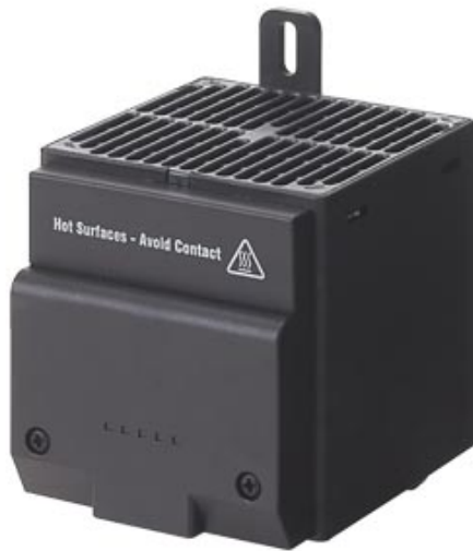
HEATERS CSL 031 SCREWING FASTENING 250 W, AC 230 V