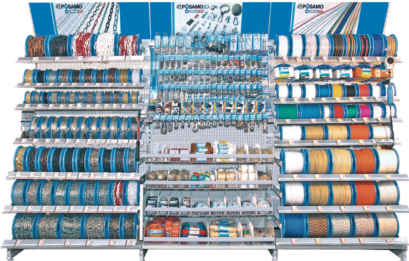
Baustein 1 = 3 x 1,25 m x Behanghöhe 1,85 m