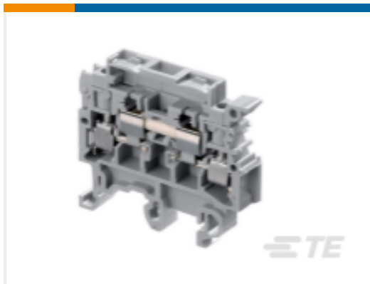
TE Part #1SNA115662R2200 M4/8.SFT