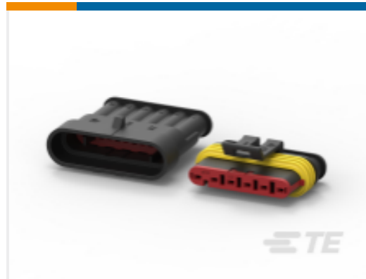
TE Part #282087-1 AMP SUPERSEAL 1.5MM, CONNECTOR HOUSING