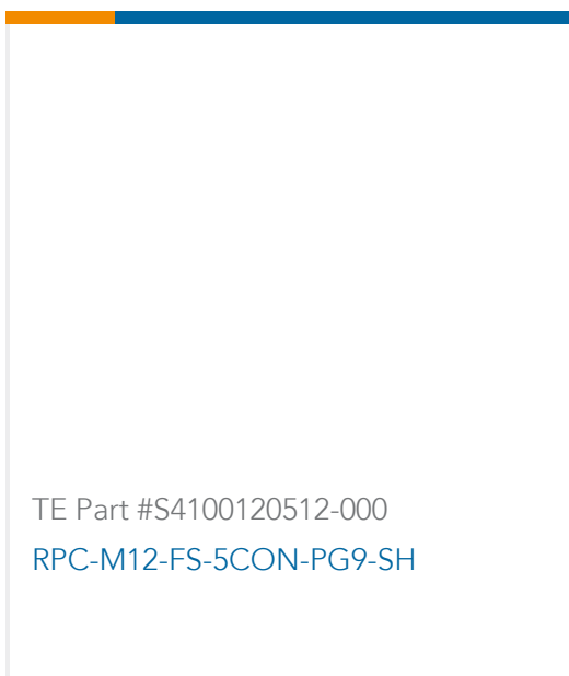
TE Part #S4100120512-000 RPC-M12-FS-5CON-PG9-SH