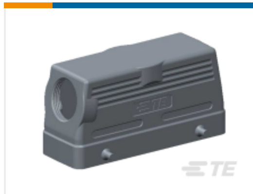
TE Part #T1210240125-000 H24B-TS-M25