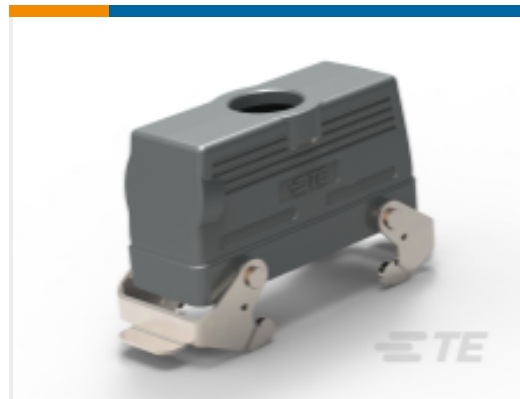
TE Part #T1260242125-000 H24B-TGB-M25