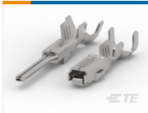
TE Part #183025-1 AMP SUPERSEAL 1.5MM, RECEPTACLE AND TAB