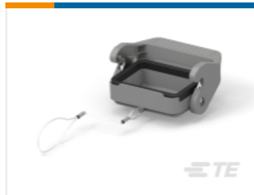
TE Part #T1010061200-000 H6B-KDTP