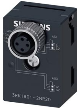
AS-Interface M12 branch U_ASI and Uaux, with M12 socket IP67/68/69K, max. 4 A