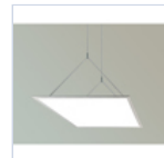
70033 SUSPENSION WIRE PANELED