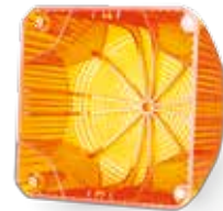
Internal diffuser and special lens pattern for optimal 360° signalling effect