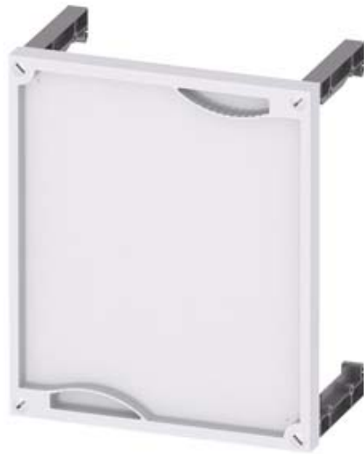
ALPHA 400/630 DIN, KIT SPACE COVER WITH SUPPORT