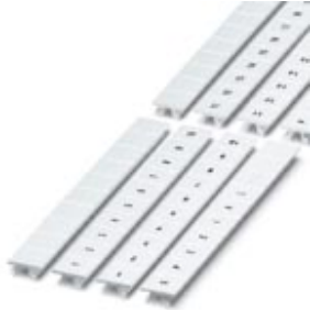
Zack marker strip, 10-section, horizontally labeled with the consecutive numbers: 1 ... 10, white, Width: 10 mm

Please be informed that the data shown in this PDF Document is generated from our Online Catalog. Please find the complete data in the user's documentation. Our General Terms of Use for Downloads are valid ( http://phoenixcontact.com/download )