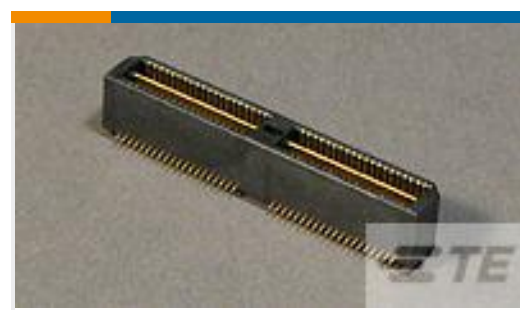
TE Part # 1658045-2 MSB0.80PL8ASY080FL,-,F,-TY