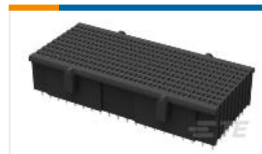
TE Part #2000905-1 Fortis Zd 20 Col Vert Center Mod Assy