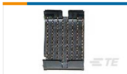
TE Part #1934331-1 Tin man Header Assy 5x16 Open