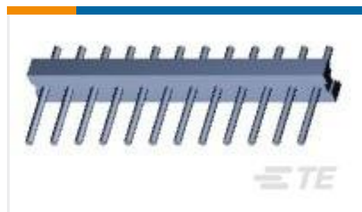
TE Part #1-640384-2 12P MTA156 HDR ASSY STR RND SN