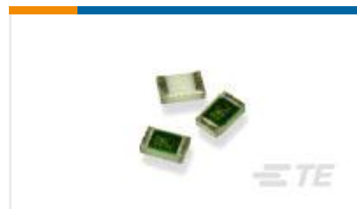
TE Part #2-1879213-6 CPF 0402 47R5 0.1% 25PPM 1K RL