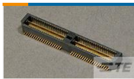
TE Part # 1658044-2 MSB0.80PL5ASY080FL,-,F,-TY