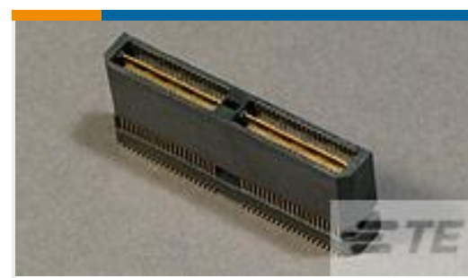
TE Part # 1658047-2 MSB0.80PL16ASY080FL,-,F,-TY