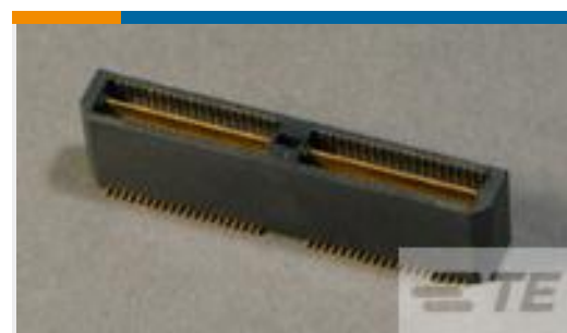
TE Part #1658015-2 MSB0.80PL11ASY080FL,-,10,-TY