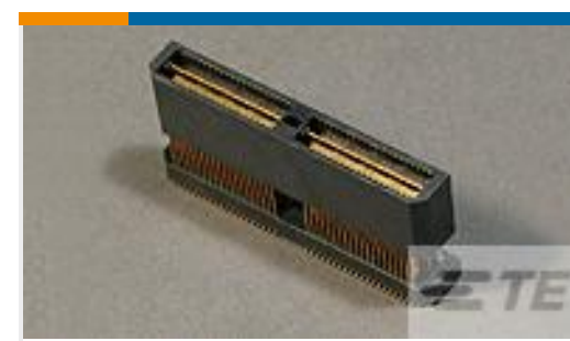
TE Part # 1658048-2 MSB0.80PL19ASY080FL,-,F,-TY