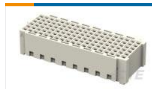
TE Part #2102061-6 Mezalok, Socket, 114 p, 10 mm, 30 Au, LF