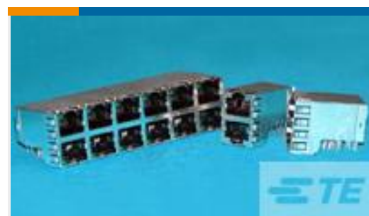
TE Part #6368062-6 2X4 OFFSET STK MJ,SHLD,R/G LED