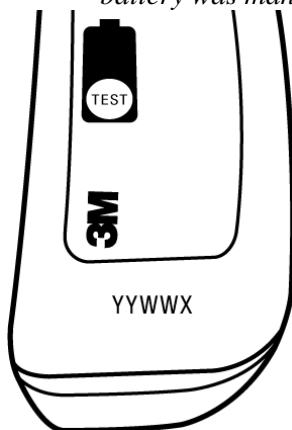
Figure 3 – Location of lot code.

For Example: Your battery has a LOT code of 14231. This means that your battery was manufactured on 23 rd week of 2014, or the week of June 8 th , 2014.