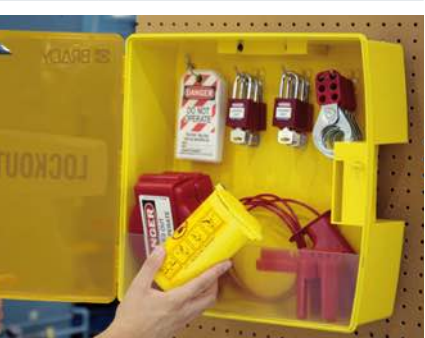
Portable Lockout Station