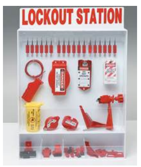
Adjustable Lockout Stations -Extra-large Lockout Station