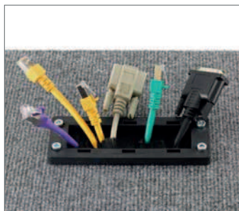
... as well as for energy and building technology