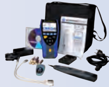
LanXPLOER PRO - Premium kit