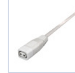
424020006 MAIN POWER L1500 REGLED ECO