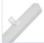
424020004 GR ACCESSORY RGL LEDECO