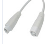
424020005 CONN PLUG 1.5MT RGL LEDECO