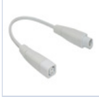
424020003 CONNECTION PLUG 150 RGL LEDECO