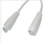
424020009 CONNECTION PLUG 2MT RGL LEDECO