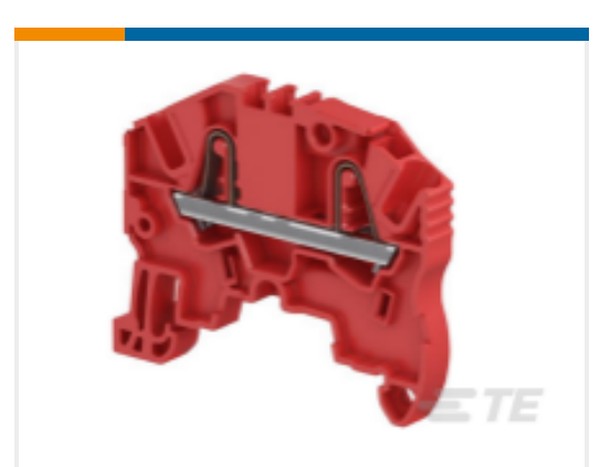
TE Model / Part #1SNK705062R0000 ZK2.5-RD